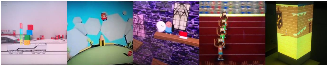
Figure 2: Screenshots from games produced at the jam from left to right: “Jump Star” a four player co-operative stacking game; “The Boy who Couldn't” a Leap Motion game where players have to bounce the character to avoid obstacles; “Castle Freak” a scaring game which uses the player's voice as an input; “Accelerunner”, a four player running simulator; “Phoenix Down”, a three player tower climbing game on a real tower.

The jump jam was designed to not only allow for experimentation and improvisation but also to facilitate community development, thus, the schedule was designed to include a number of social events including an introductory meet and greet, a social mixing event after the first evening and an arcade and awards event at the