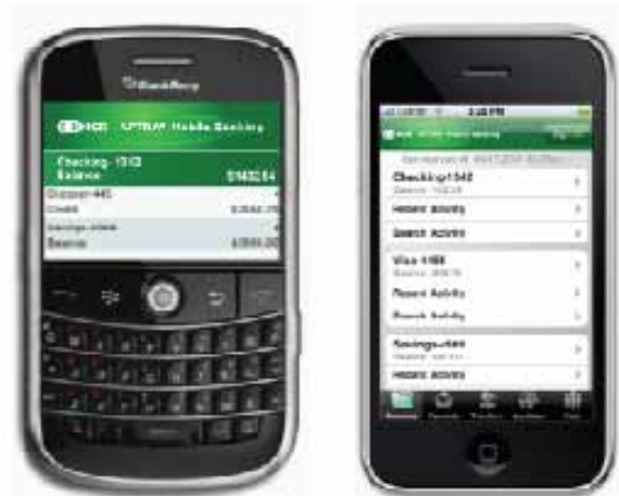
Figure 3: Designs for mobile banking application