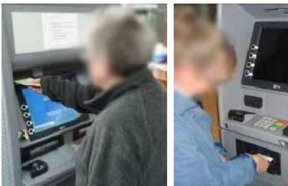
Figure 2: Images from recent ATM usability study

In this type of study a new product range has typically been completed, and therefore a usability study with members of the general public is required; an example of this was conducted just over a year ago. This study, with 100 participants, focused on three main features that had not been previously assessed; namely a biometric fingerprint reader, a contactless card reader, and a bulk cheque deposit module (Figure 2). A representative sample of ages, heights, and genders were recruited. The lead through used in this study was developed from the findings of the previously mentioned biometrics study. In addition, as it was suggested that biometric performance degrades with age, the sample included a large number of participants over the age of 65 (22%).