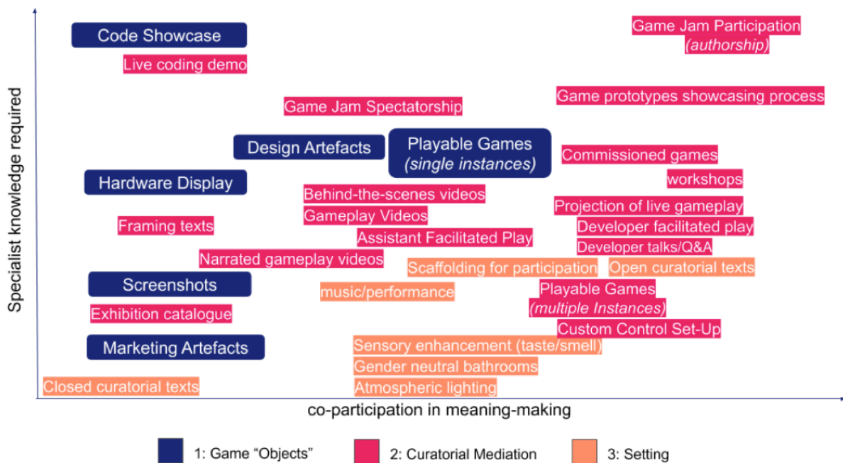
Figure 1: Reception based model of the three layers of meaning-making opportunities in an exhibition assessed against the reader/player's role in co-production of meaning and the specialist knowledge required.

The game objects (layer 1) in general are deemed to have lower co-participation in meaning-making due to the largely closed nature of the media. Playable games have the greatest level due to their indeterminate nature and need for participation to exist. The potential within a game can be difficult to unlock for players with limited game playing experience or social concerns about playing in public and/or an institution, thus these objects require some level of specialist knowledge.