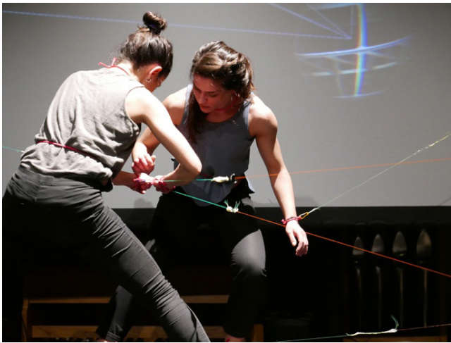
Video 1. The demonstration of composition process of Locus (2015). See: vimeo.com/252392147/29e5af8932 .

their bodies and to improvise to find out how to move within the restrictive conditions without sound. Second, once they got used to moving within the conditions, I then provided more specific choreographic tasks section by section depending on the structure of the sound composition. During this process, the dancers proposed how they would create choreography with my movement tasks and I selected good materials. Finally, we repeated the proposing, selecting, and modifying process several times until we completed the composition.