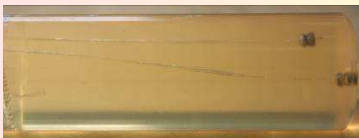
Fig 1. Pellet tracks in gel contained in a knife holder

Extensive research has been conducted on various aspects of firearms, but much less work has been carried out into air weapons. The public perception is that airguns are less hazardous because the projectile has much lower energy: However, most firearms offences within the UK are by air weapons. The majority of these are lesser offences such as vandalism, and minor assault but a number of incidents occur with serious or fatal outcomes. This study was therefore carried out to develop understanding of the behaviour of air pellets.