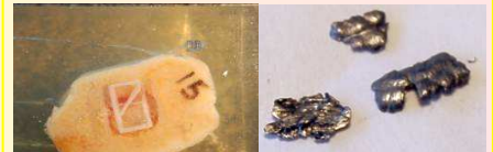
Fig 6 Impact of pellet. Fig 7 Pellet damage

the pellet and absorb the energy from the pellets, resulting in lower impact energy. Most damage to the pellet occurs with the smaller angles (direct impact) rather than the larger angles (oblique impact) where the pellet is deflected. Consequently, the distance travelled after impact depends on the angle of incidence.