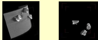
Fig 4 Bone & pellet Fig 5 Bone filtered from scan

One advantage of CT scanning is the ability to differentiate different materials and to filter out the bone, thus allowing examination of the pellets in situ by rotating the image in 3 dimensions. Figures 4 and 5 present 2-D images to demonstrate this.