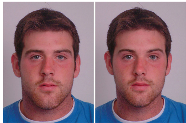
Fig. 1 Examples of masculinised ( left ) and feminised ( right ) versions of face images used in our experiment

The experiment consisted of two phases: an initial priming phase and, subsequently, an ally preference test (adapted from Watkins and Jones 2012; Watkins et al. 2012a). In the initial priming phase of the experiment, each participant was randomly allocated to one of four conditions: a condition where they were instructed to imagine winning a physical fight, a condition where they were instructed to imagine losing a physical fight, a condition where they were instructed to imagine winning a contest for promotion and a condition where they were instructed to imagine losing a contest for promotion. Contests for promotion against same-sex colleagues have been used as scenarios in prior research on behavioural responses to competition (Griskevicius et al. 2009). The participants were given the following instructions: "Please take a moment to imagine that you have just been involved in a 'physical fight'/'contest for promotion' with 'someone'/'a colleague' of the same sex and age as you and that you 'won'/'lost' the 'fight'/'contest'. Imagine how 'winning the fight'/'winning the contest' made you feel/losing 'the