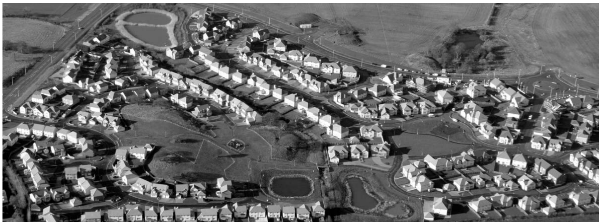
Figure 1 Pond 7, top left

Sample relationships for Pond 7 were applied to cost data for the other four SUDS to project construction costs to 2005. Table 1 below illustrates the difference in construction costs between SUDS and traditional drainage for 2 storm return periods. In all cases the SUDS are less expensive to construct than the hypothetical traditional underground chambers.