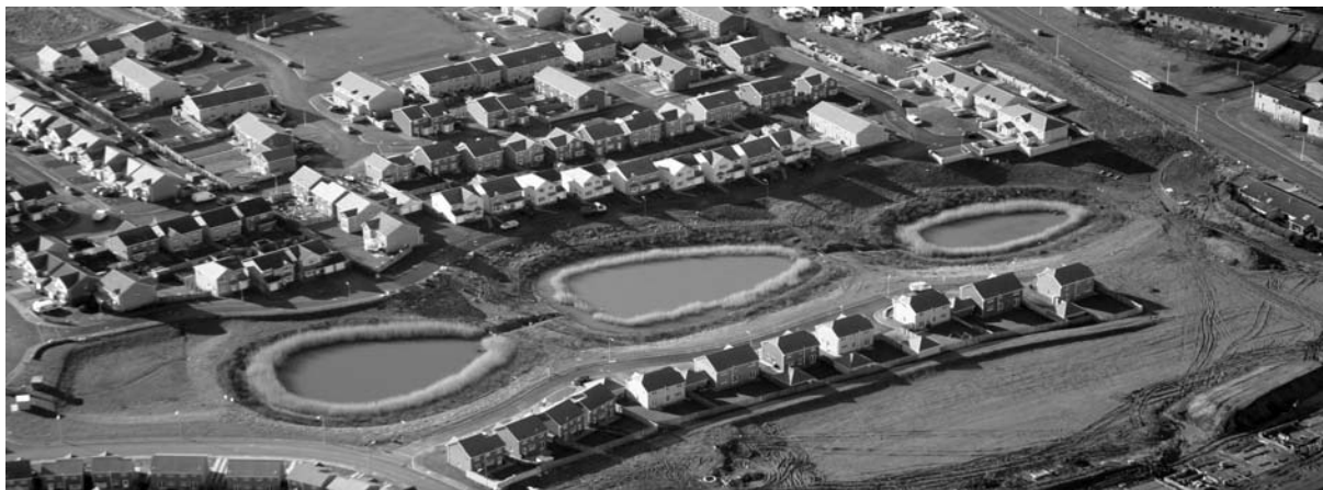
Figure 2 Cascades Pond Treatment Train, detention basin on the left, at the head of the pond

The analysis presented here compares the cost of constructing and maintaining a stormwater drainage system based on SUDS against traditional underground storage chambers. Hypothetical designs for the chambers were costed on the basis that they would attenuate 50 and 100 year storm events. The SUDS were designed to attenuate the 100 year event.